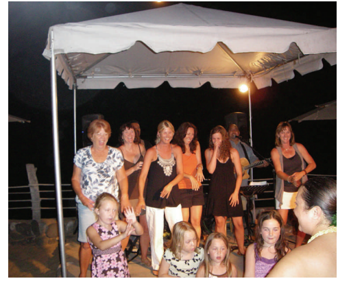
Those wonderful, fantastic, superb, VOS Chapter Leaders at WORK!