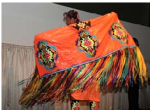
Native American Dancer

After months of planning and anticipation, on February 17, 2011, a group of almost 150 Chapter members, Construction Industry partners, and their guests convened at the Heard Museum in Phoenix, Arizona to help us celebrate our 25 years as a Chapter of CFMA.