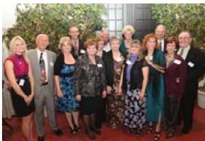
Past Presidents who attended