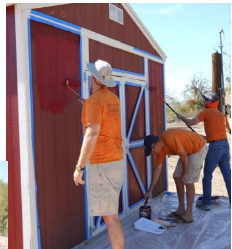
Community service project.